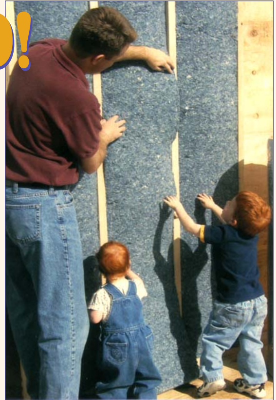
“What’s in Your Walls?”

UltraTouch contains no chemical irritants and requires no warning labels compared to traditional products. UltraTouch contains no harmful airborne particulates that can enter your living area and the surrounding environment causing health concerns. UltraTouch has no VOC outgassing concerns and contains no formaldehyde or fiberglass.