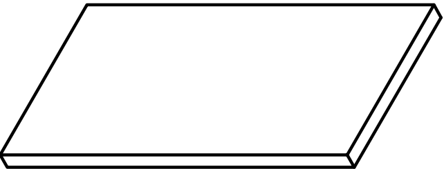
3 PERSPECTIVE N.T.S.